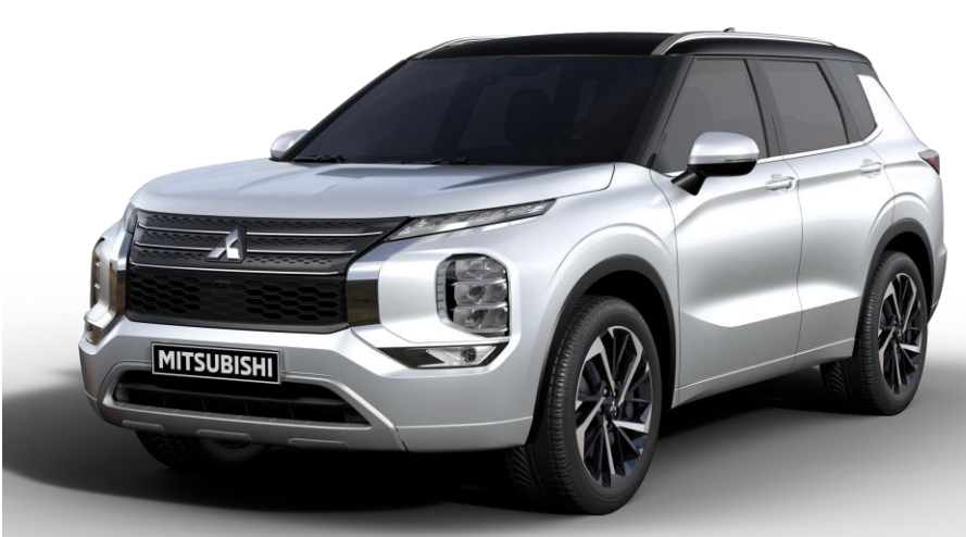
White Diamond with Black Roof